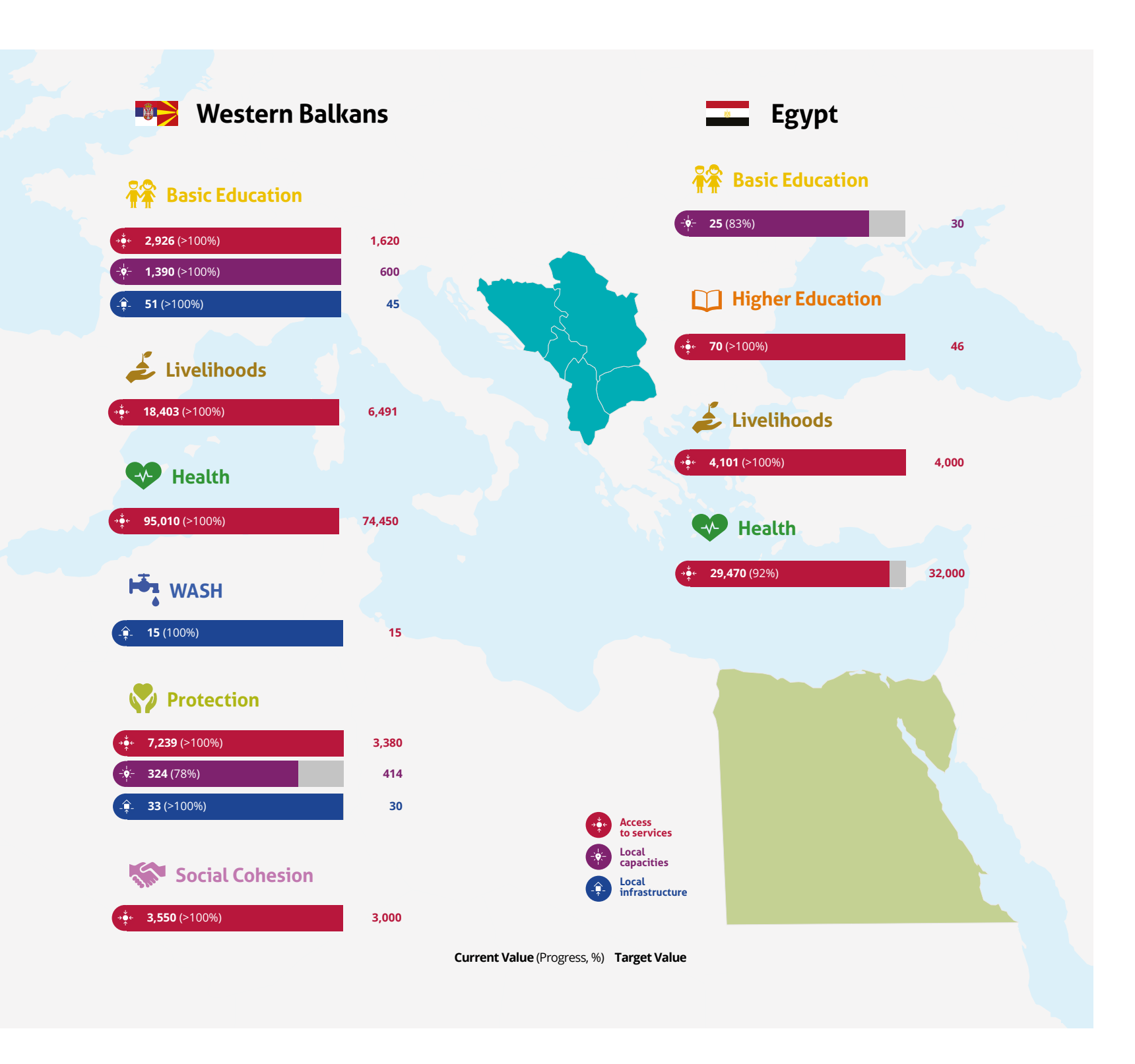
Figure 20: Trust Fund progress in other countries (as of 31/03/2024)