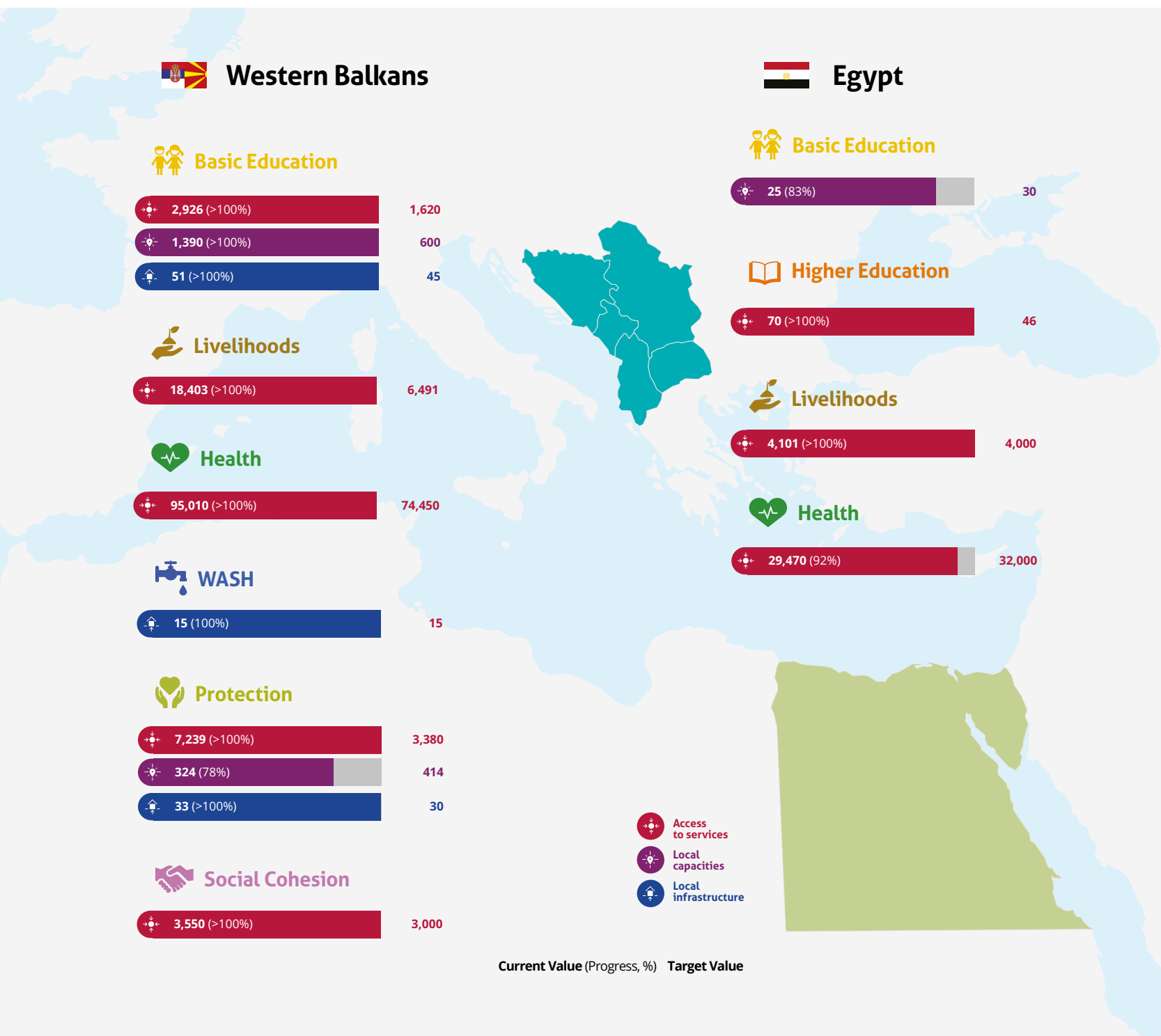
Figure 20: Trust Fund progress in other countries (as of 31/03/2024)